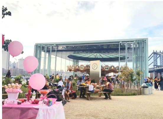
Outdoor Picnic Tables (for use in summer & nice days)