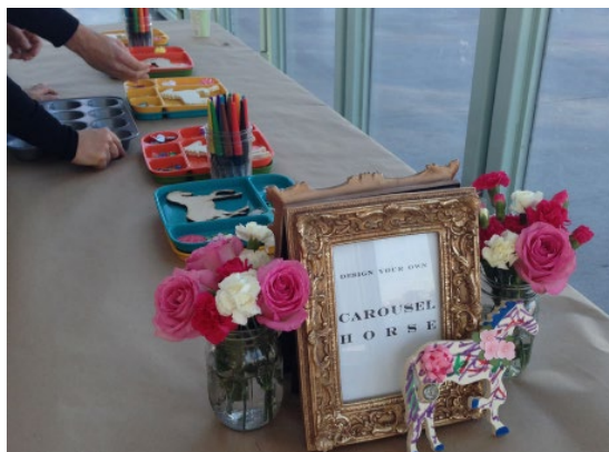
Indoor Tables (for use in winter & rainy days)